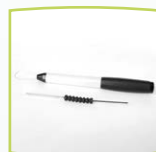
Probe cleaning kit