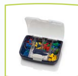
Eartip box with eartips