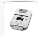
Wireless thermal printer HM-E200